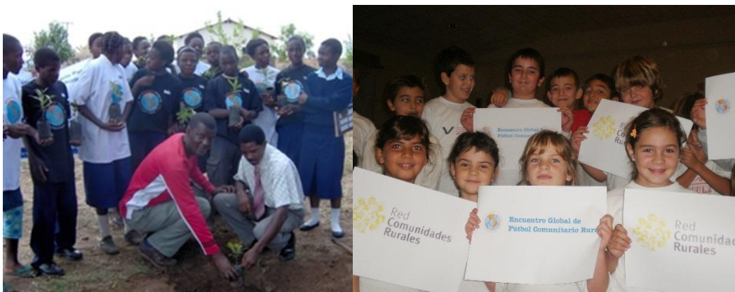
Tree planting by students of a rural school in Zambia, and children at a school in a town close to Barcelona, Catalunya, Spain. Two of the hundreds of community actions carried out within the framework of this gathering.

More than 200 rural schools and communities from Argentina, Uruguay, Chile, Bolivia, Cuba, Costa Rica, Spain, Bosnia-Herzegovina, Republic of Azerbaijan, Malaysia, Sri Lanka, Egypt, Democratic Republic of Congo, and Zambia participated in the 2 nd Global Rural Community Football Gathering . On the last Friday of October, 2010, thousands of children and youth played football celebrating solidarity actions they engaged in with their families to help improve their schools and communities. The results were extraordinary: vegetable gardens, mobile libraries, tree plantings, theatre performances, playgrounds, educational campaigns and even the building of a road 3500 meters above sea level between two previously isolated places. Local actions but global communication. Photographs, testimonials and exchanges travel from one place on the planet to another through www.futbolrural.org.ar .